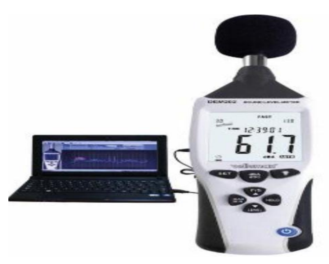
Figure 1. DM202 integrating portable and professional sound level meter by velleman.

Noise level measurements were conducted at KTSC-textile mill. Proper care was taken against reflected sound waves from the operators' body when the sound level meter was used. The noise level was recorded at a regular interval of ten (10) minutes for twelve times at nine different unit processes (i.e. six unit processes at spinning mill and three unit processes at weaving mill; see section below). The measurements were done for 4–5 h/d. The instrument used for measurements was a precision integrated portable professional sound level meter (vellman, Belgium, model DM202; (Figure 1)).