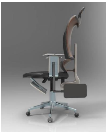
Figure 3. Design chair in 3D side view [designed by solidworks 2017 x64 edition].