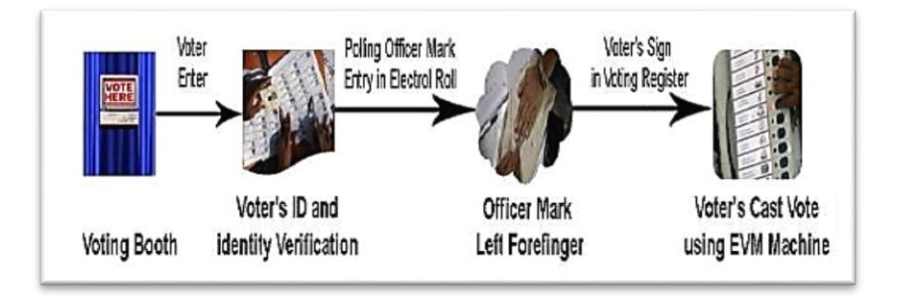
Figure 1. Existing voting process scenario.

The Figure 1 shows the voters who need to reach the polling booth. The first step is identity verification, which is verified by the staff on duty. Then, the official left an inedible ink mark on the left index finger of the voter. After that, the voter must sign on the register and enter the voting room. To mark a vote, voters must press the candidate button on the EVM machine on the name and symbol of their choice. When the button is clicked by voter, the indicator light will glow on the symbol with a beep, indicating that the vote has been successfully recorded. Every time this process needs to be repeated, the building and manpower of the voting place need to be adjusted [43].