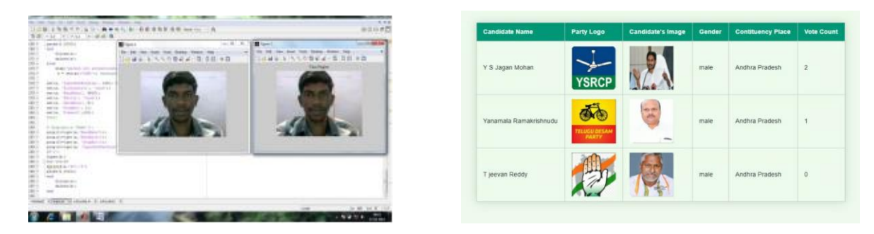
Figure 7. Face verification.