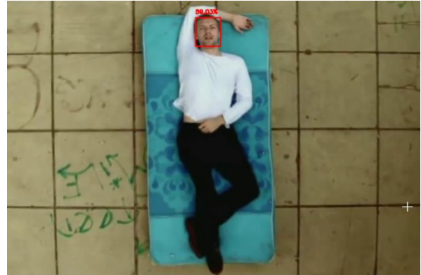
Figure 9. Result showing face detection in video using our proposed model [88].