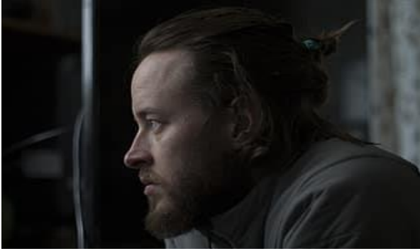
Figure 2. Non-frontal face image [86].