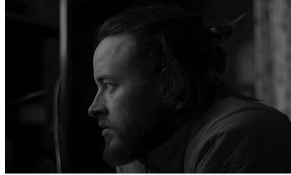
Figure 3. Non-frontal face image with variation in lighting condition.