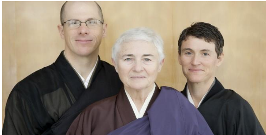
Figure 4. Face image of people of different age groups [87].