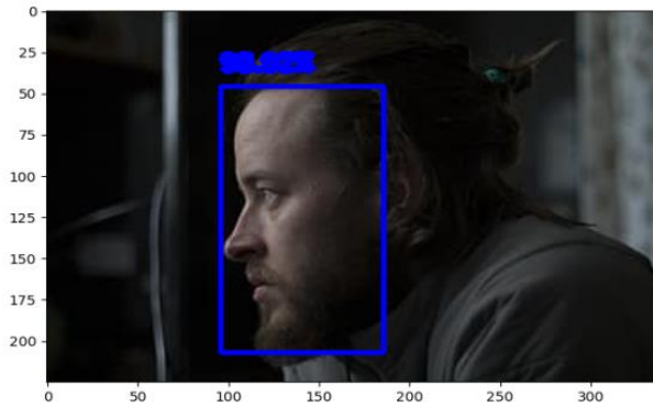
Figure 5. Result showing face detection in image using our proposed model [86].

The face recognition algorithms have significantly improved as compared to the early seventies. Deep learning methods have replaced traditional methods. The Deep learning-based methods are the new standards due to their improvement in accuracy in recent times. Also, the Deep learning methods are scalable, as their accuracy can be improved by expanding the dataset. Deep learning methods require labeled datasets, which are expensive and are slower to train and test.