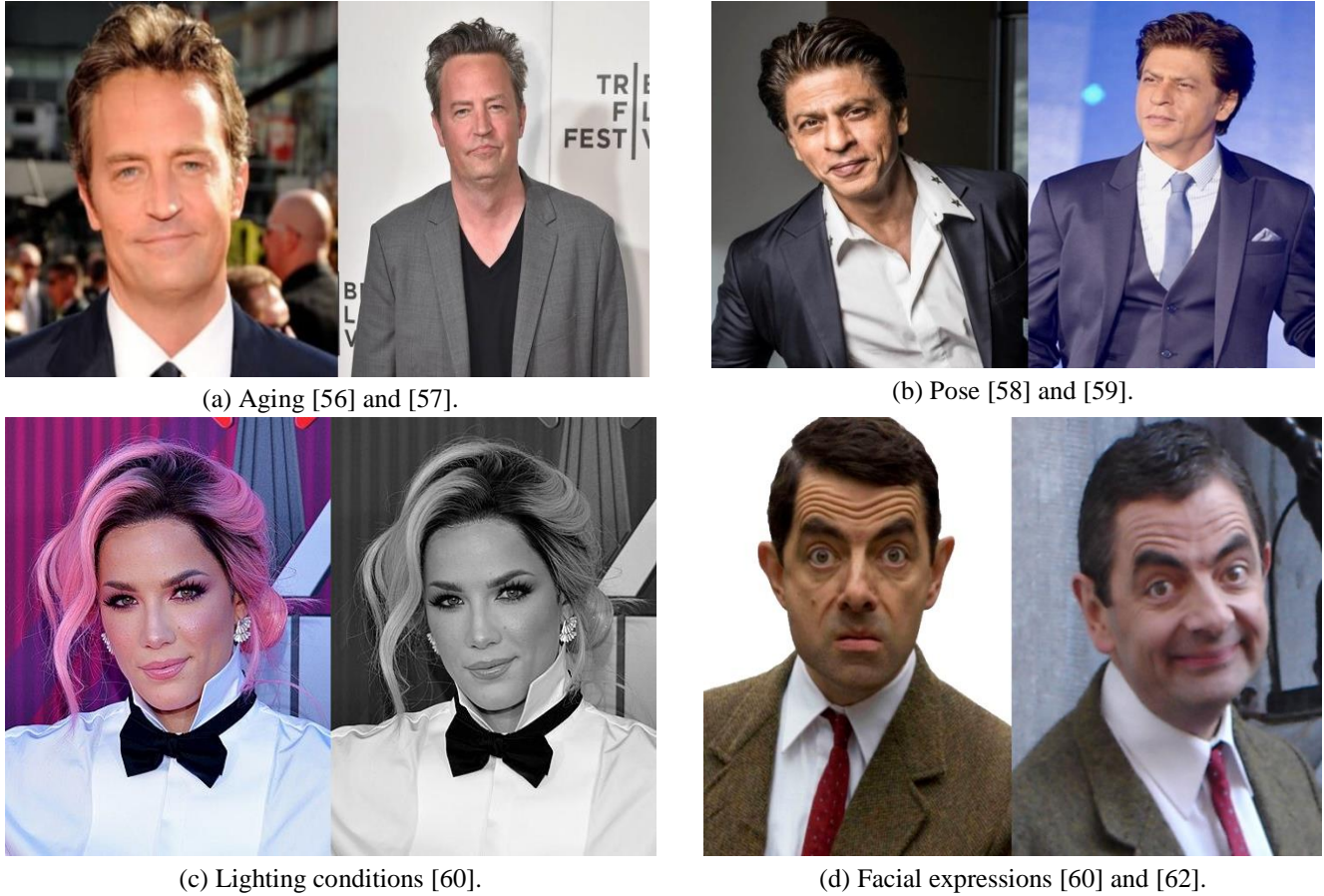
Figure 1. Variations of different style.