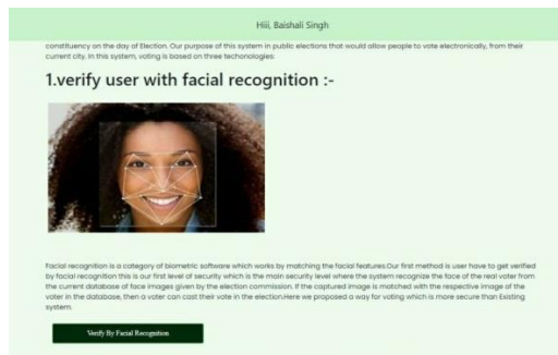
Figure 5. Verify by facial recognition.