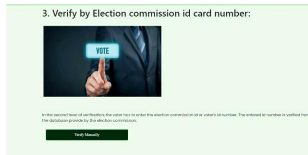
Figure 6. Verify manually.