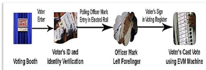
Figure 1. Existing voting process scenario.

The Figure 1 shows the voters who need to reach the polling booth. The first step is identity verification, which is verified by the staff on duty. Then, the official left an inedible ink mark on the left index finger of the voter. After that, the voter must sign on the register and enter the voting room. To mark a vote, voters must press the candidate button on the EVM machine on the name and symbol of their choice. When the button is clicked by voter, the indicator light will glow on the symbol with a beep, indicating that the vote has been successfully recorded. Every time this process needs to be repeated, the building and manpower of the voting place need to be adjusted [43].