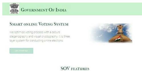
Figure 3. Home page.

This proposed system will be beneficial in many ways. The voter verification will be based on face recognition, Aadhar verification and also the voter Id. Only verified voters can vote. Voters can only vote once. Therefore, multiple voting or virtual voting is prohibited. This proposed system will limit the voting time period and only allow voters to vote during that time period. Since there will be no crowds, there is no chance of violence. As an automated system, there is no need to arrange elections in different locations. Voting results can be generated automatically and quickly. This proposed system is uninterrupted, consolidate, economical and time-centric. Now In this section we are going to give some snapshots of proposed system.