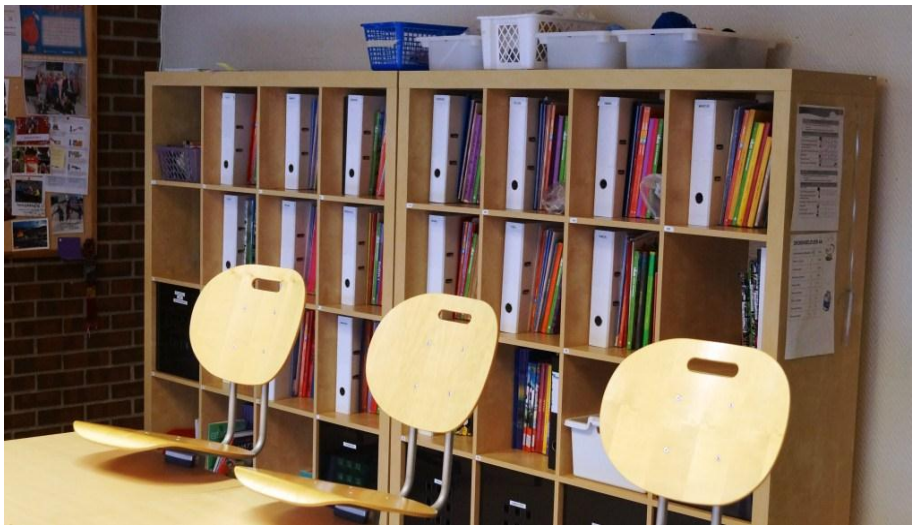
Figure 2. 5S System in a Classroom [15].

Classroom can be improved by the implementation of 5S. The practice of 5S starts with the teacher, not the students. It is more than just cleaning up; it is about maintaining an organized and efficient work-space without clutter and waste of time for searching and preparations. 5S meets additional challenges in a school setting because the school is a public place with many users (Figure 2). Without proper and intuitive 5S systems, the schools can quickly become a haven for waste.