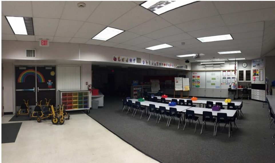
Figure 3. Sort of a Classroom [15].

We standardized the label and the laid out class information, calendar, schedule, upcoming menus, and reminders. We used different colors to differentiate between topics which were the great applications of visual management. This made it clear how to maintain the great work that is done in the sort, set in order, and shine phases of 5S.