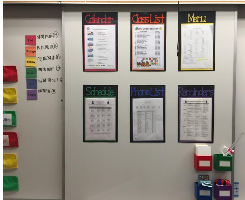
Figure 4. Standardize the Classroom [15].